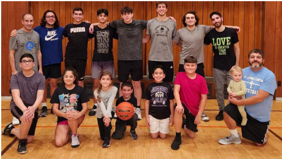
Getting ready for the 25th Annual Midwest Basketball Tournament